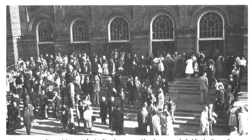
The massive Gary Memorial Auditorium engulfs the record Sabbath Day Congregation of 2,121 people for the Feast of Pentecost.