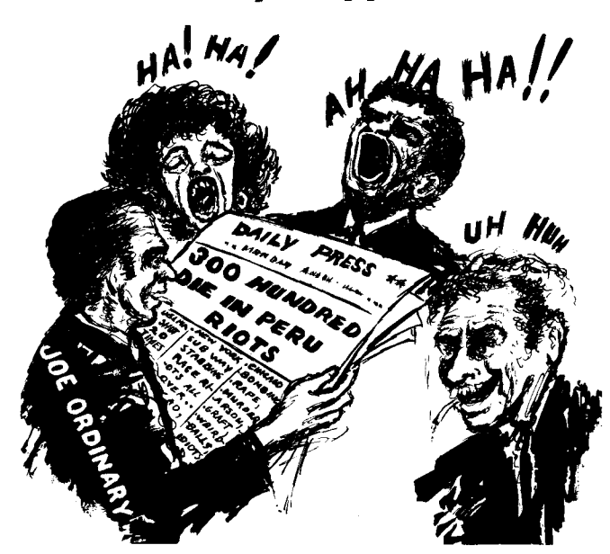
"For men shall be lovers of their own selves"—"without natural affection." II Timothy 3:2-3.

Lima, Peru. Reports have come in that police were needed to quell violence over a soccer incident. Fans protesting the officials' decision rioted and police used tear gas to halt the crowd. When thousands of spectators rushed to the doors, men, women and children were trampled underfoot. Estimates of the dead and injured well exceed 300.